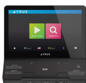
UNITE 16" TOUCHSCREEN