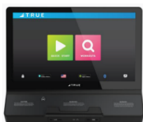
UNITE 22" TOUCHSCREEN