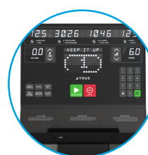
Multiple console options