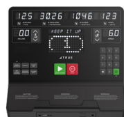
UNITE LED CONSOLE