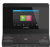
UNITE 10" TOUCHSCREEN