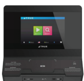
UNITE 10" TOUCHSCREEN