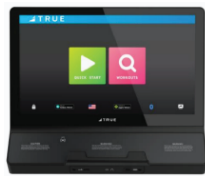
UNITE 22" TOUCHSCREEN