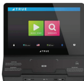
UNITE 16" TOUCHSCREEN