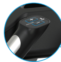
Easy-access quick-touch keys