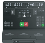
UNITE LED CONSOLE